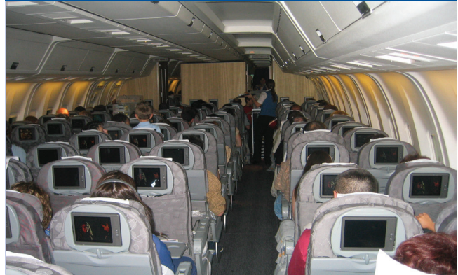
FIGURE 1 Aircraft cabins are high occupancy density, with air currents moving aerosols along four or more rows longitudinally either way, making social distancing impractical and infectious aerosol exposures more likely, while the low cabin humidity weakens our immune system's defense against infections. Humidity is kept low by ventilating with very dry outdoor air that needs to be humidified and also by the continual loss of cabin humidity from the recirculation air due to the movement of a portion of the cabin air to behind the insulation where the moisture in it condenses and freezes on the cold skin and fuselage.

divided by the number of persons in the space), outdoor air supply per person and the rate of virus-filtered air supply per person.